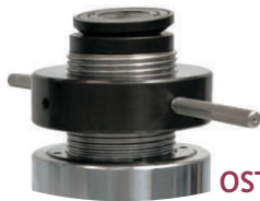
OSTS / OLTS Series